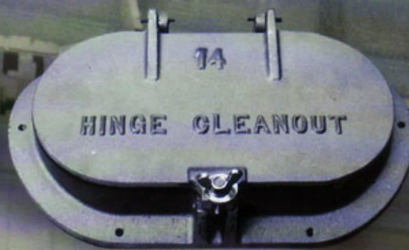
Aluminum "Contoured-Hinged" Clean-Outs