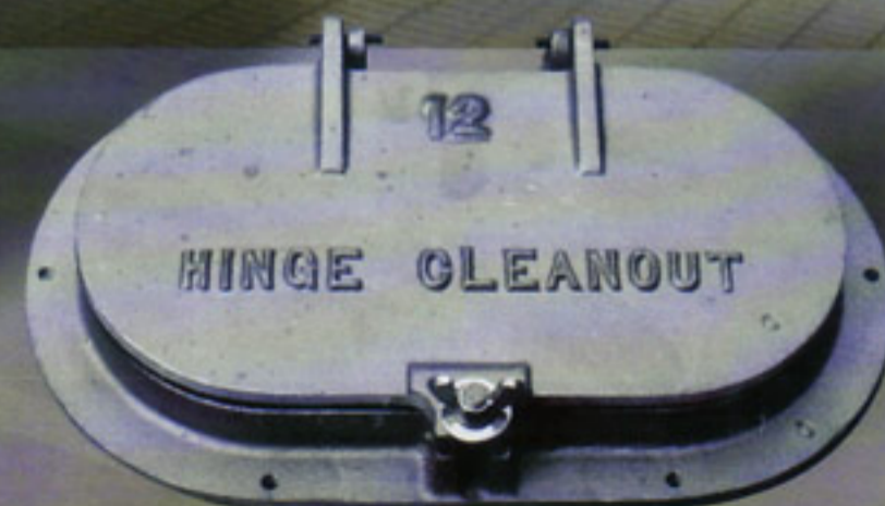
Aluminum "Flat-Hinged" Clean-Outs