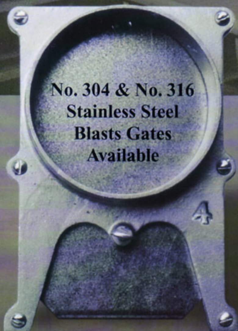
Aluminum Full Blast Gate Cut-Offs