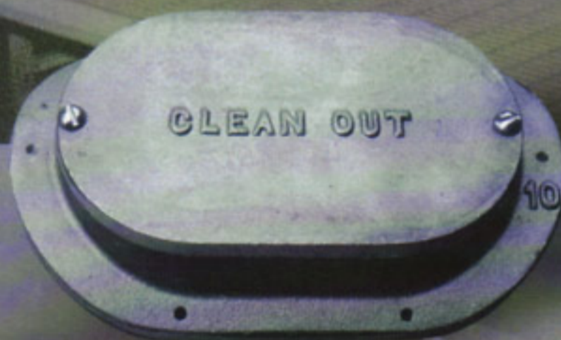
Aluminum "Contoured" Clean-Outs